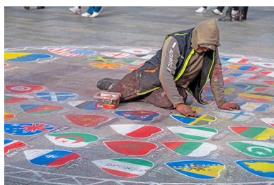
Kenney Snell Street Art