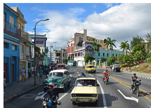
Eileen Strenecky A Street in Cuba