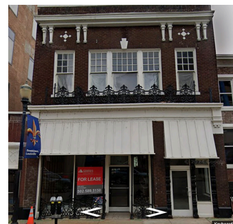
436 South 5th Street, the home of Powell Seed Store in the 1930s and 1940s.