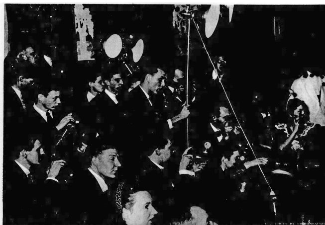
ONE CAMERA to every three people (or maybe it was the other way around) came to the first get-together for Louisville camera fans Monday night. Held at the Plantation, it was sponsored by the Louisville Movie Club. On all sides were photographers taking pictures of photographers taking pictures of—here's where we came in. About 275 attended. Those fellows above are snapping the floor show.